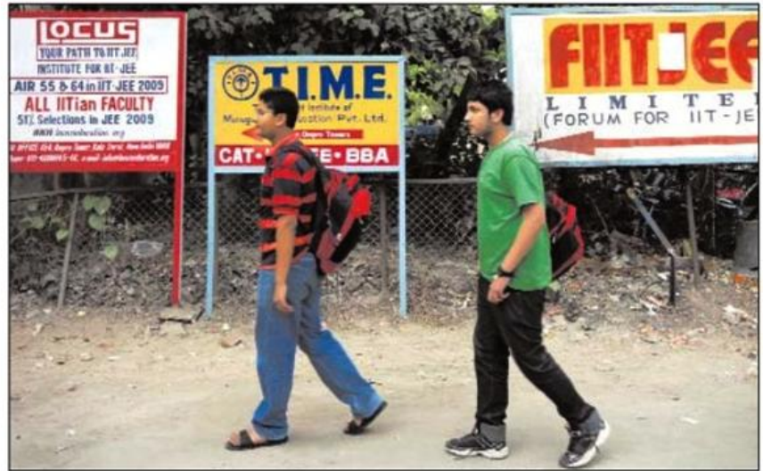
Advertisements of IIT-JEE coaching centres greet students in Kalu Sarai.