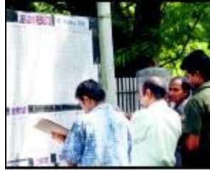
People check the results of IIT-JEE at IIT-Madras

This is how the IITs select a quota student: Let's assume the last general category student is admitted with an overall score of 100 (out of 480), and the aggregate cut-off for an SC/ST student would be 50 (after a 50% relaxation). To select students for the preparatory course, the IITs will further lower the qualifying score by another 50% (25 marks).